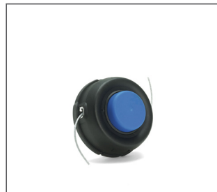
TAP 'N GO TRIMMER HEAD Twin line cutting system with Tap 'n Go for quick line feed.