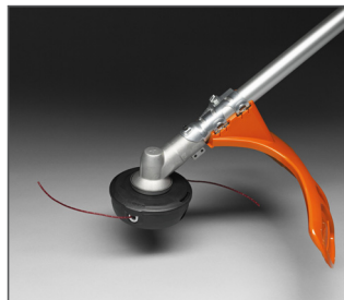
GRASS BEVEL GEAR Bevel gear designed with high torque and the cutting equipment parallel to the ground for best cutting performance