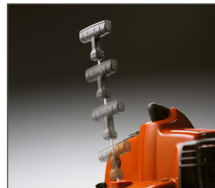
SMART START® The engine and starter have been designed so the machine starts quickly with minimum effort. Resistance in the starter cord is reduced by up to 40%.