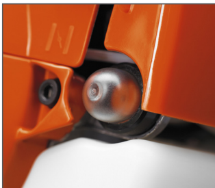
FUEL PUMP Fuel pump designed for easy starting.

Husqvarna 362M18 is a powerful mister. The efficient fan provides excellent discharge and coverage performance. Adjustable nozzle for various applications.