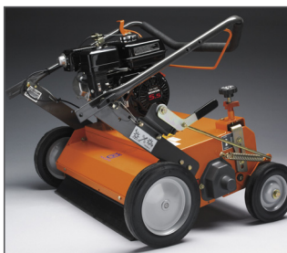
COMPACT DESIGN Compact design, low weight and folding handle for easy transport.

The DT22 is a truly robust dethatcher, designed for tough, professional jobs under extended periods. Compact design, powerful engine and the unique option of using it as a sowing machine make the DT22 virtually indispensable for lawn care companies etc. Can be fitted with three different types of cutting equipment, and with a collector as well. Ideal for contractors, rental companies and other professional applications.