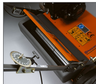
SEED HOPPER Seed hopper for 14 kg of grass seeds. (accessory). Adjustment for torrent of seed convenient placed on the handle.