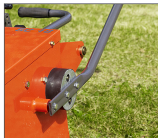
COMMERCIAL COMPONENTS High-specification components ensure years of reliable use.